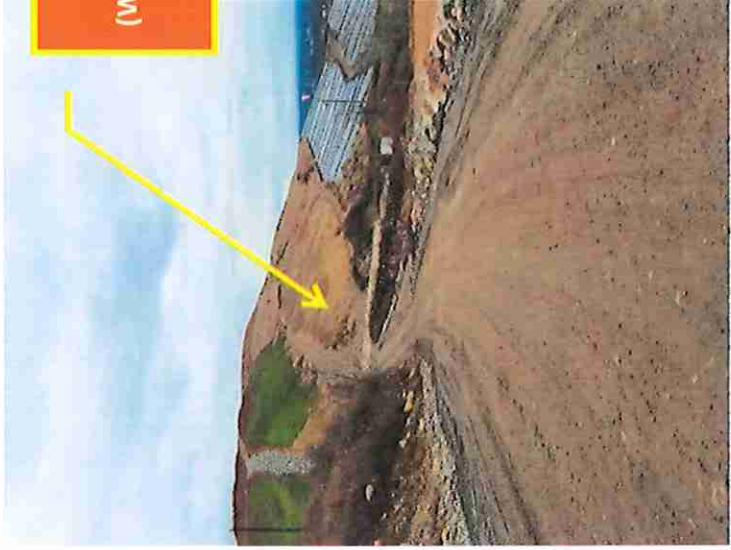
East end of landfill

Leachate Seep repair area (Work to be started Wednesday, December 6 th )